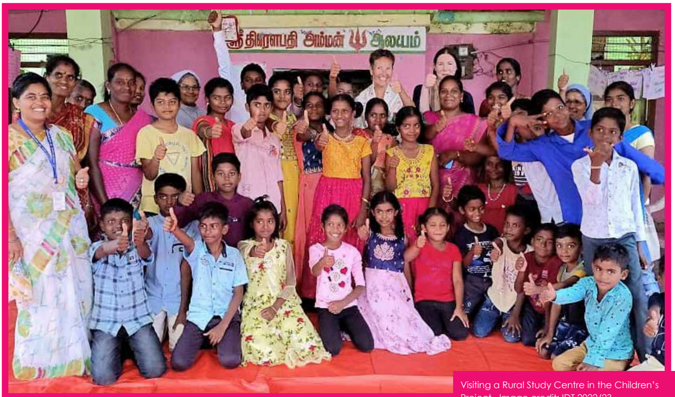
Visiting a Rural Study Centre in the Children's Project.